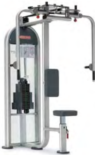
PEC FLY/REAR DELT