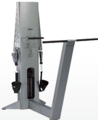
STANDING QUAD DIMENSIONS: 63" L X 37" W WEIGHT: 431 LBS