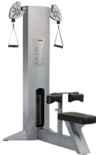
ROW DIMENSIONS: 56" L X 36" W WEIGHT: 387 LBS