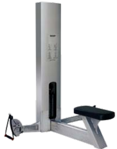
BICEP DIMENSIONS: 56" L X 61" W WEIGHT: 400 LBS