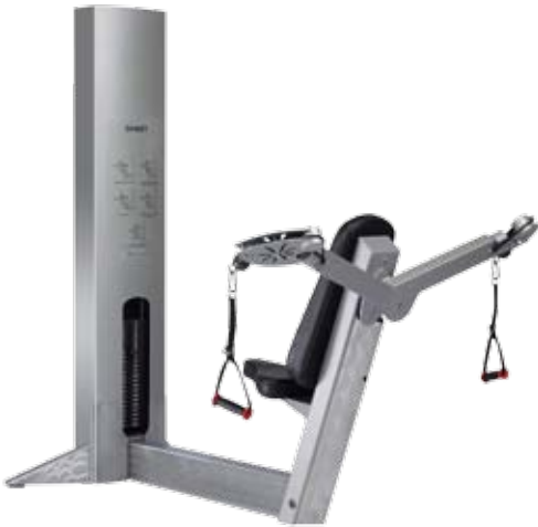
CHEST DIMENSIONS: 71" L X 53" W WEIGHT: 483 LBS