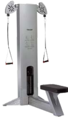
TRICEP DIMENSIONS: 56" L X 36" W WEIGHT: 393 LBS