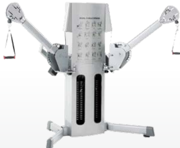
DUAL CABLE CROSS DIMENSIONS: 63" L X 37" W WEIGHT: 431 LBS