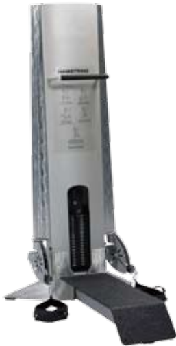
HAMSTRING DIMENSIONS: 56" L X 36" W WEIGHT: 393 LBS