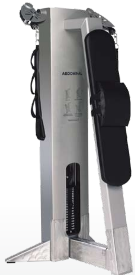
ABDOMINAL DIMENSIONS: 34" L X 36" W WEIGHT: 419 LBS

Customize upholstery colors to the color scheme of your property and embroider your corporate logo. Contact your Hotel Fitness Club® sales representative for details!*