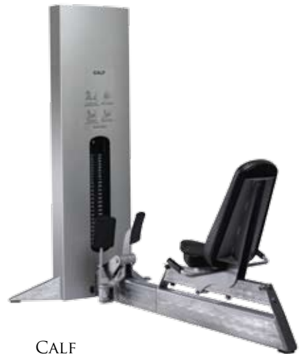
CALF DIMENSIONS: 80" L X 42" W WEIGHT: 776 LBS